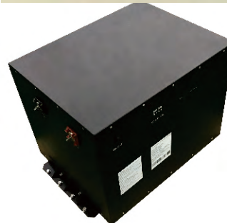
Mongolia Military RV Demo: HP6KW 24VDC 220VAC INVERTER 9.6KWH Battery Pack Customization