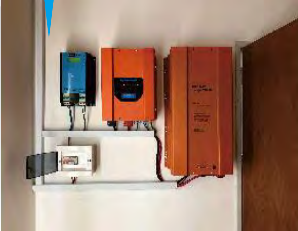
US Home Storage Demo: HP3KW 48VDC 120VAC INVERTER 5.2KWH Battery Pack