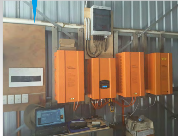
Au. Office Storage Demo: HP10KW 48VDC 240VAC INVERTER 5.2KWH Battery Pack*3 parallel