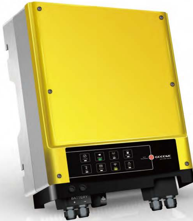
SBP Series Hybrid Inverter 3.6/5.0kW